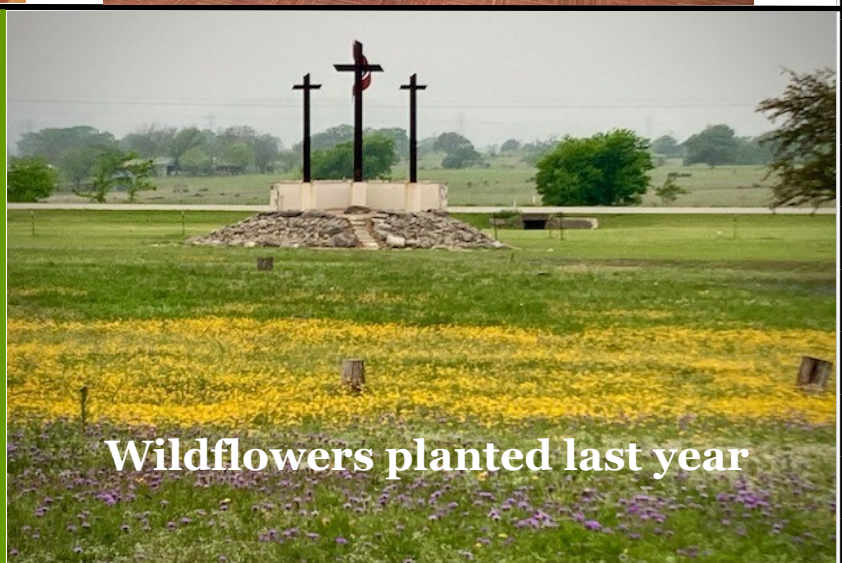
Wildflowers planted last year